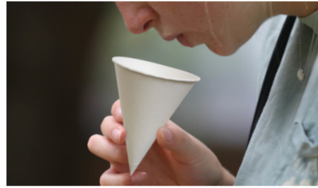
By Saliva collect cup